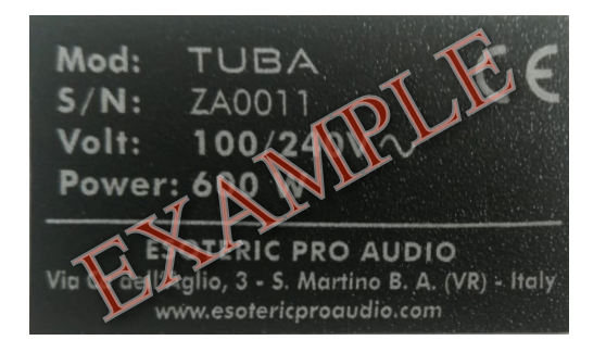
Fig.3.1 Example of a label (the data shown are purely indicative, the real values are shown on the label of the product).

The plate attached to the back of the SUBWOOFER CORNO contains all the identification data of the SUBWOOFER itself.